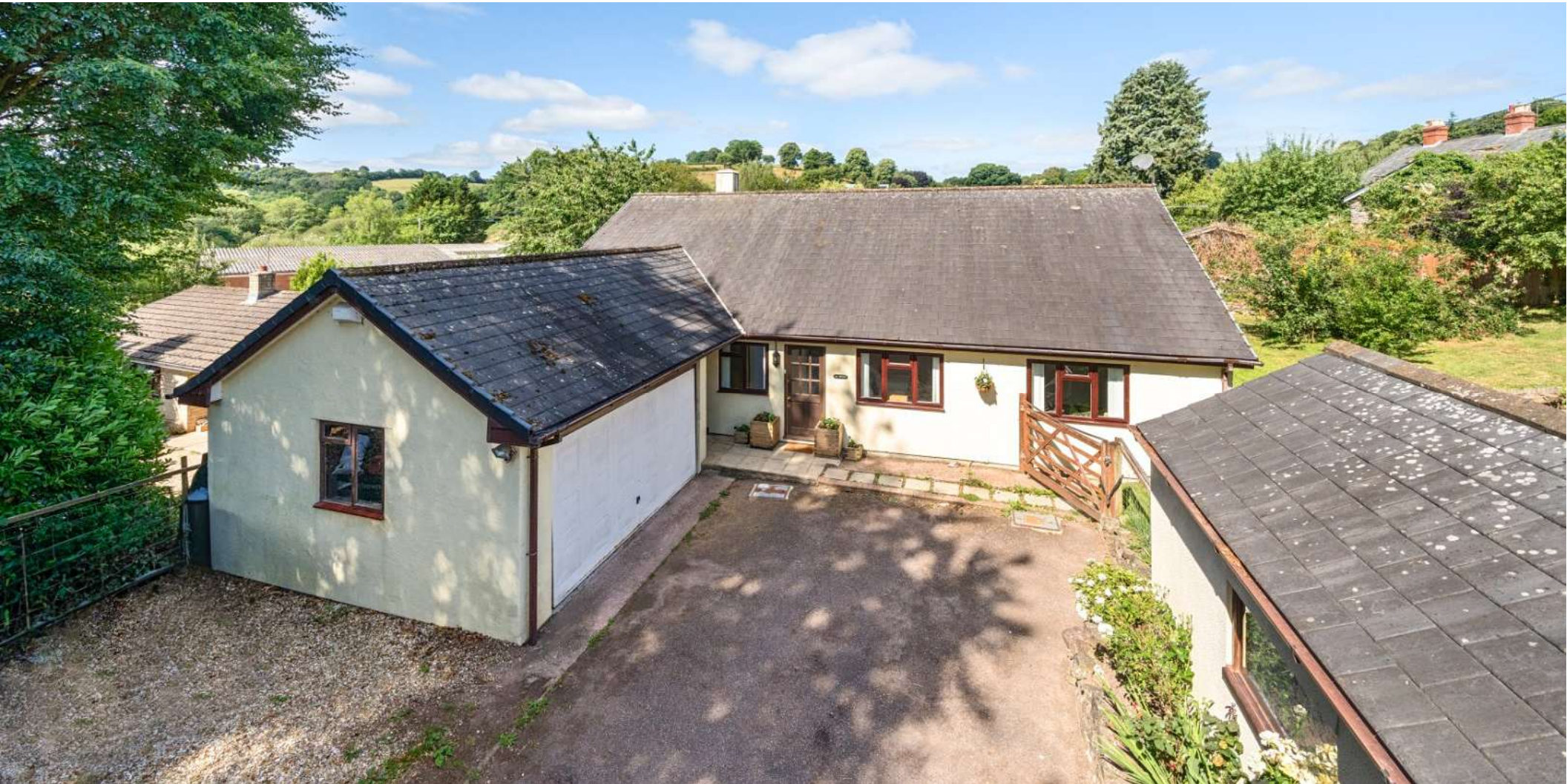
La Roche, Lords Meadow Lane